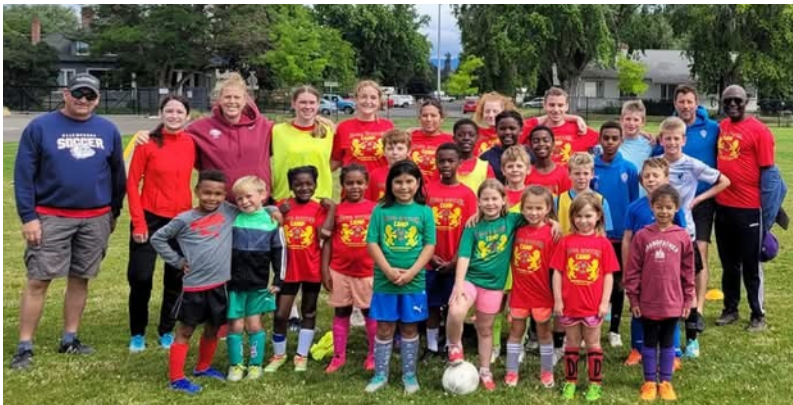
Bawa Summer Soccer Camp Fundraiser, Ellensburg, WA