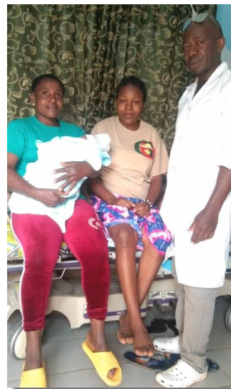
Baby born at the clinic