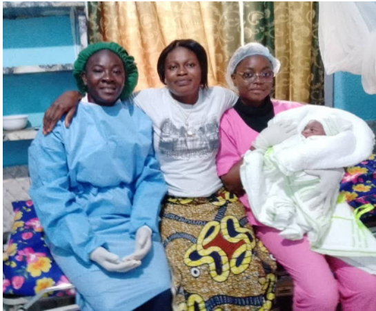
Baby born at the clinic