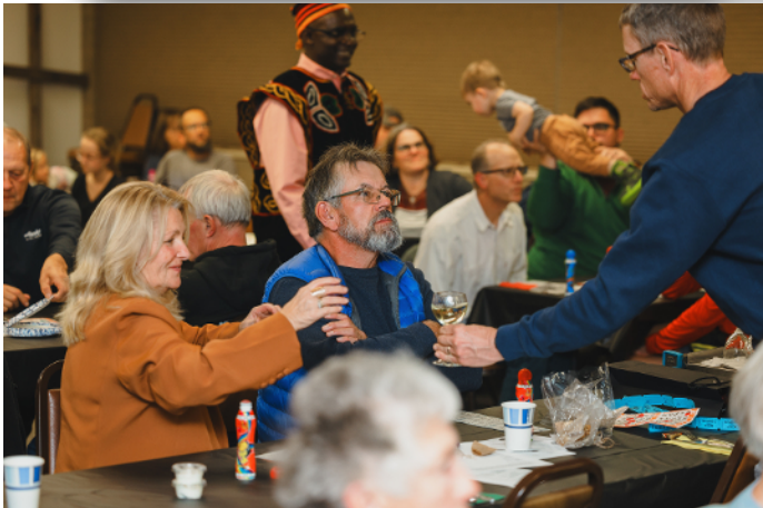
Dinner & Bingo Night at St. Andrews, Ellensburg, WA