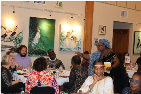
Bawa Dinner Fundraiser, Issaquah, WA