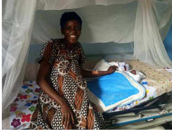
Twins born at the clinic