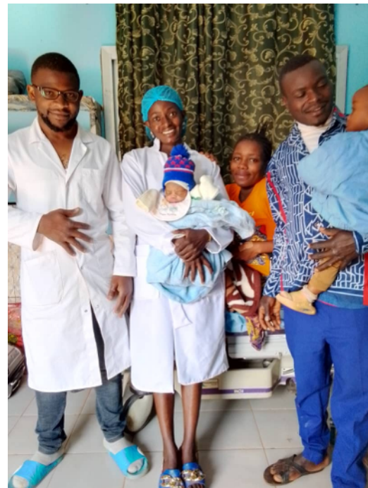
JANUARY 2024 BABY

We are so grateful for their unwavering commitment.