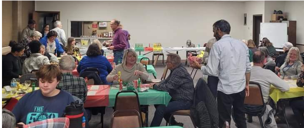
Dinner & Bingo Night at St. Andrews, Ellensburg, WA