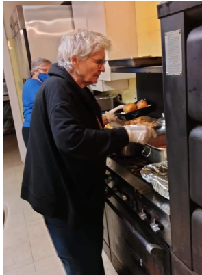
Bawa Dinner Fundraiser, Connecticut