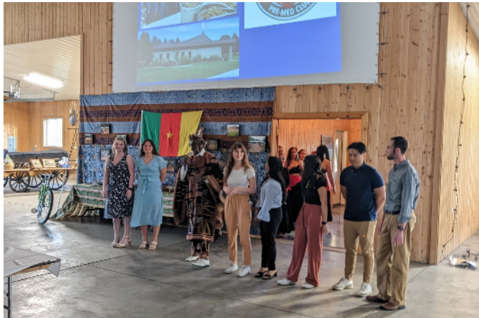
Bawa Dinner Fundraiser, Ellensburg, WA