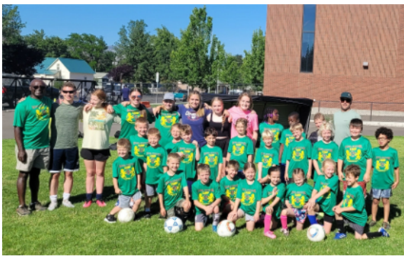
Bawa Summer Soccer Camp Fundraiser, Ellensburg, WA