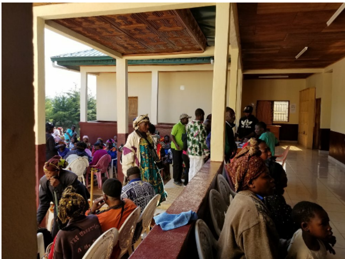
Gathering at the clinic

A special thank you to the visiting doctors that travel to BAWA and donate their time and medical knowledge to support the needs of the BAWA Community