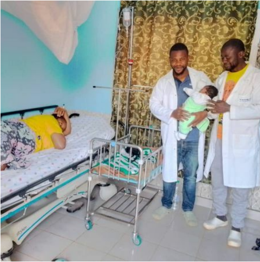
Baby born at the clinic